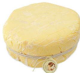
PEPE SAYA SIGNATURE STYLE BUTTER (150GM TO 10KG)