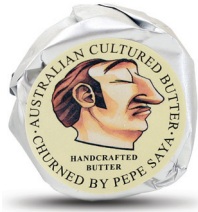
PEPE SAYA WRAPPED BUTTER 15GM&25GM