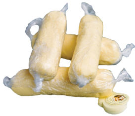
PEPE SAYA BUTTER LOGS 2.5KG ALSO AVAILABLE IN TRUFFLE BUTTER