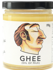
PEPE SAYA CULTURED GHEE 1 LITRE