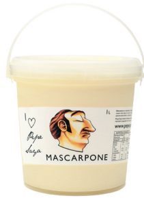
PEPE SAYA MASCARPONE 1 LITRE