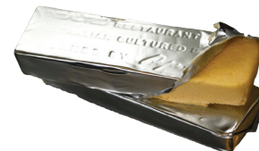
PEPE SAYA STAMPED BUTTER BAR 200GM