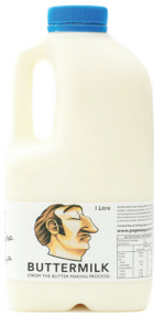
PEPE SAYA BUTTERMILK 1 LITRE