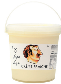
PEPE SAYA CRÈME FRAICHE 1 LITRE